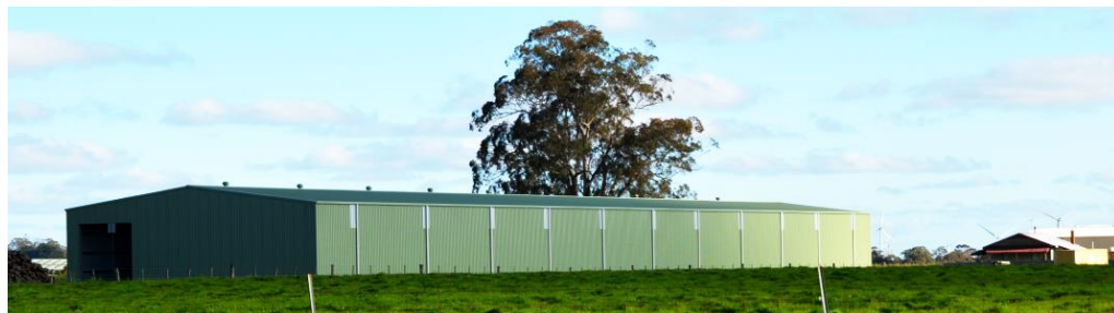
Australia's newest tram depot