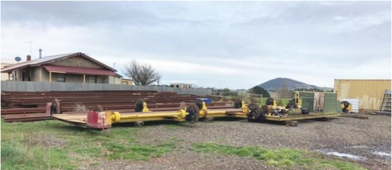
The traverser after delivery to Bungaree

When Preston Workshops was redeveloped one of the old traversers (dating from the mid 1980s) was set aside for use in a heritage environment. It has now been moved to Bungaree and will give connect the 5 roads there with a loading ramp to enable moving trams in and out of the Bungaree storage without the need for cranes.