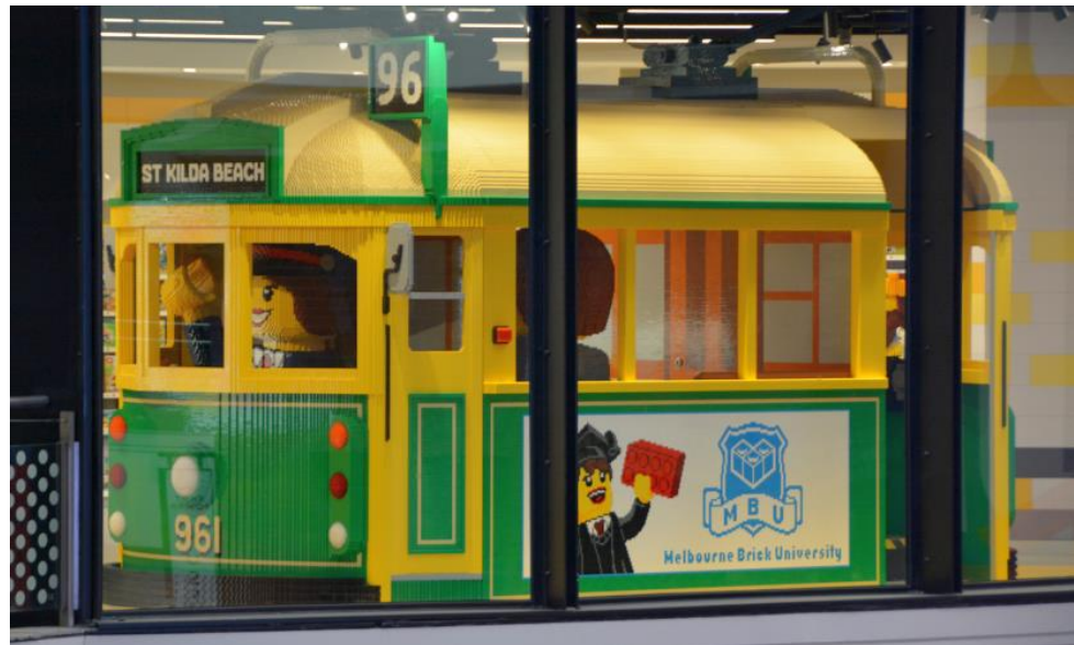
This Lego model at Melbourne Central shopping centre is big enough to step inside.